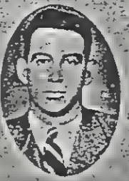
H. W. McCants Dry Goods Retail